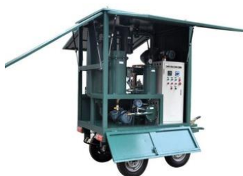
Double axles trailer