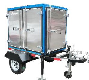
Single axle trailer